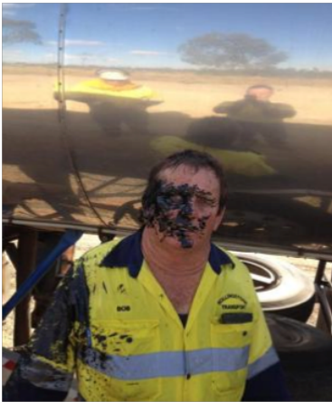
Bitumen on truck driver's face was spread, due to the operator trying to cool his face with a damp cloth